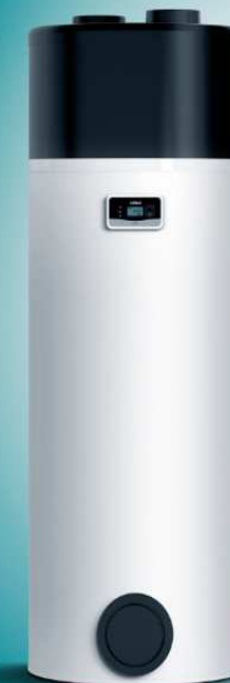
aroSTOR floor standing domestic hot water heat pump

For all who are looking to build future.